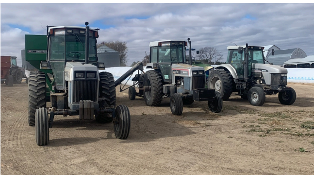
Beautiful white tractors on the farm.

Over the years, the family has implemented a Total Mixed Ration (TMR) feeding method for the herd. TMR combines various feeds into a single mixture, that is formulated to meet specific nutritional requirements. This approach ensures the cows receive the essential nutrients needed for milk production, growth and reproduction. Andrew noted that this feeding method has enhanced the dairy herd's profitability by increasing the butterfat content in the milk and allowing the cows to breed back sooner.