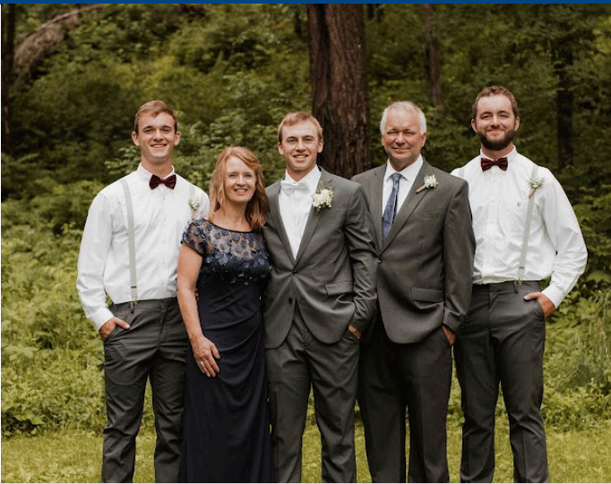
Gathje Dairy Farm Family.

The rural landscape of southern Minnesota is sculpted by the nearby Mississippi River, accompanied by small streams and rivers that traverse through the valleys and wooded bluffs. In its open prairies sits the Gathje Dairy Farm near Pleasant Grove, Minn.